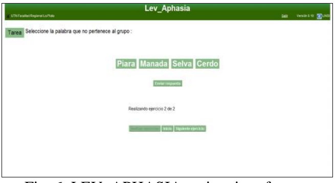
Fig. 6, LEV_APHASIA patient interface (example).

As you can see in the figures 5 and 6, the interface is very user-friendly.