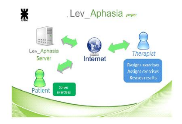
Figure 2. LEV_APHASIA system lay-out.

The project has different goals and aims, but the most important is the possibility of interaction between patient, therapist and web exercises.